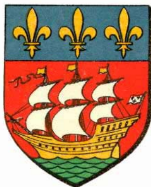
LA ROCHELLE, ÎLE DE RÉ